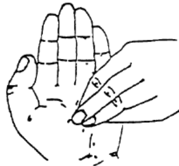
6. Rotational rubbing, backwards and forwards, with clasped fingers of right hand in left palm and vice versa