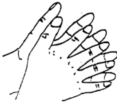
3. Palm to palm fingers interlaced