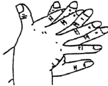
• Right palm over left dorsum and left palm over right dorsum