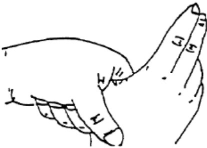
5. Rotational rubbing of right thumb clasped in left palm and vice versa